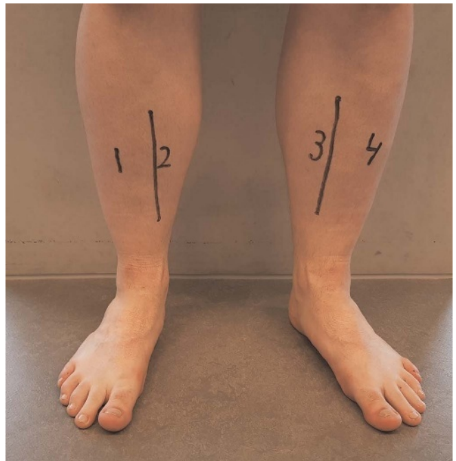
Figure 1: The RLPP, a pain scoring system used to diagnose patients with ERLP. Patients are asked every minute to give a pain score of 0–10 for four regions of the legs. The vertical line indicates the medial tibial border.

Before commencement of the exercise test, all locations indicated for pressure measurement are anesthetized with 1–2 mL xylocaine 1.0%. ICPM is always conducted in the first minute postexercise, with a Stryker® pressure measurement device. Pressures are recorded when the device shows a constant number, approximately 10 s after introduction of the needle in a particular compartment. The patients are supine, with the knees at the edge of the table and the legs hanging vertically toward the floor. Pressure measurements of the deep posterior compartment are done through the anterior compartment. Thereby, the skin is penetrated only once for measurement of both the anterior and the deep posterior compartment. From July 1, 2014, every patient was asked to score ICPM needle pain on a scale of 0–10, immediately after