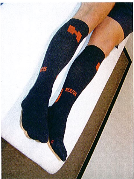
Fig. 31.3 Sport compression sleeves

intramuscular pressures and reduce the time of onset of complaints during exercise (Zimmermann 2013a).